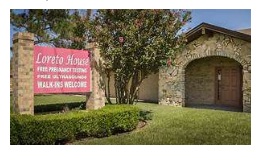
The Origin of the Loreto House Name

Loreto House is an independent 501c3 Catholic pregnancy resource center located in Denton Texas. The core mission of Loreto House is to provide confidential mentoring and counseling to women dealing with an unplanned pregnancy. Additional services include free pregnancy tests and non-diagnostic ultrasounds. Loreto House is not a medical clinic and does not provide medical services. The compassionate staff and volunteers serve people of all or no faiths with loving care and professionalism. As an official apostolate of the Diocese of Fort Forth, all services are provided in alignment with the teachings of the Catholic Church. http://loretohouse.org