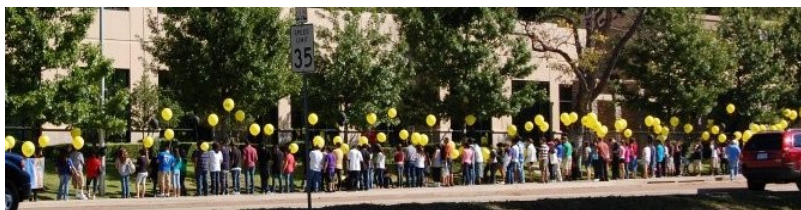
Youth pray while holding yellow “Life” balloons on 40 Days for Life-Dallas Youth Day