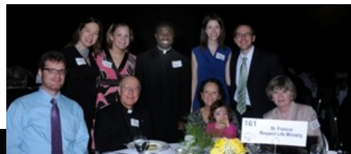
St. Francis Respect Life Ministry