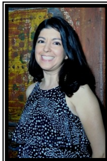
Rita Reis Banquet Hall