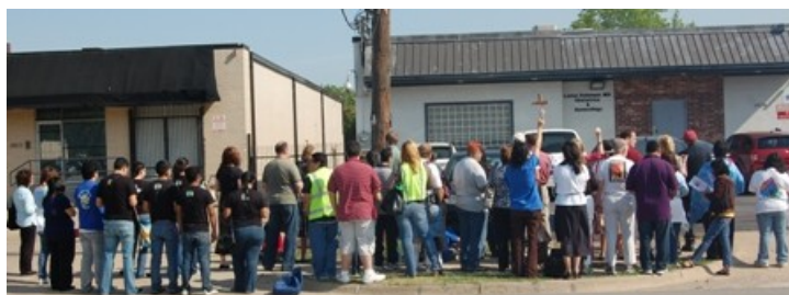
CPLC Quarterly Rosary Procession outside Robinson's

We praise Holy Almighty Triune God – Father, Son and Holy Spirit – for the blessings of this day.