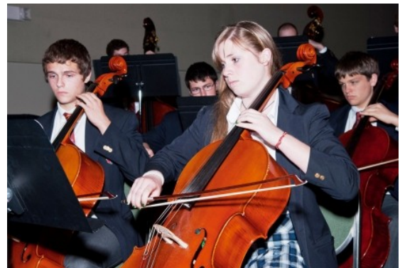
John Paul II Orchestra performs