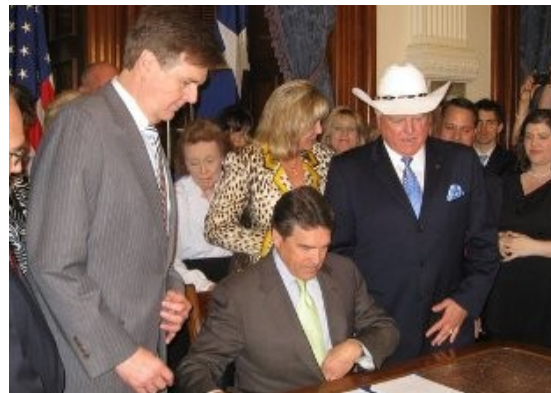
Governor Perry Signs Sonogram Bill

While there were many pro-life leaders across the state who were instrumental in passing these bills, the Catholic Pro Life Committee of North Texas is recognized by many as a grassroots force through its regular e-communications providing legislative updates and urging action by you – devoted advocates for Life. For this reason, the CPLC’s