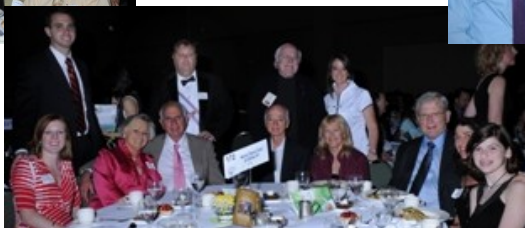
Notre Dame Club of Dallas