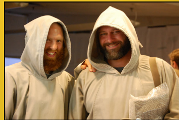
Dynamic Pro-Life Speakers