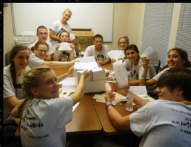
Two Camps This Year!