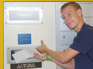
Pro-Life Volunteer Projects in Dallas & Fort Worth