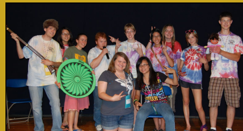
Good Pro-Life Fun