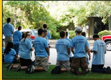
Daily Prayer in front of the abortion centers