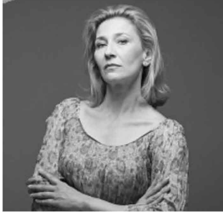
Trust the Holy Spirit at times like this.

Do not accept the framework of competing rights, of "choice" versus "life." Make it about helping women in difficult situations, offering support for both mother and child. Don't try to "win." Like St. Bernadette, we are asked to tell them, not convince them. The Holy Spirit will do that with the seeds that we plant.