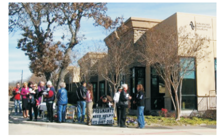
Praying at Southwestern abortion center

The battle at 8616 Greenville Ave. is still being waged through peaceful prayer, silent witness and community outreach at the Southwest