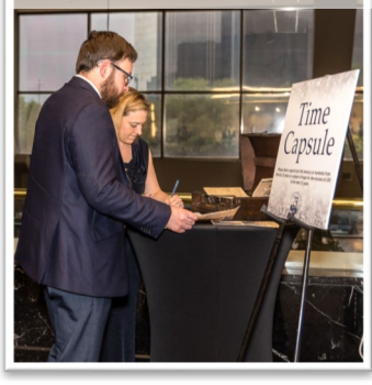
Dinner guests leave a message to be included in the 25-year Time Capsule