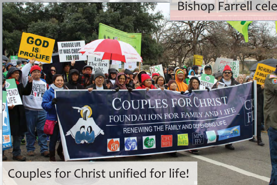
Couples for Christ unified for life!