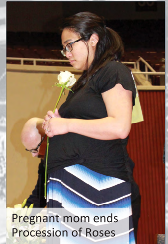
Pregnant mom ends Procession of Roses