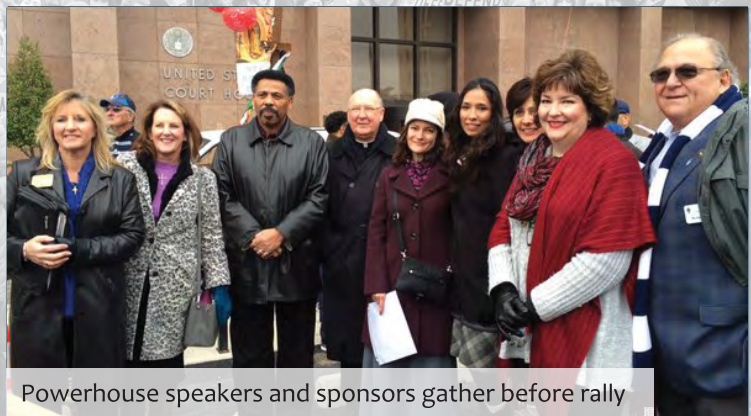
Powerhouse speakers and sponsors gather before rally