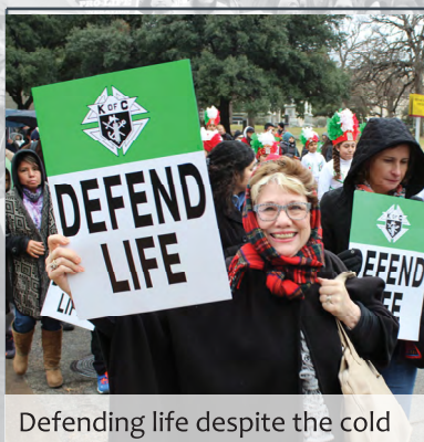
Defending life despite the cold