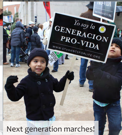
Next generation marches!